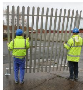
Fitting the panel

Panels are simply lifted into place onto the fixing tails and secured by bolting the panel angle to the fixing tail.