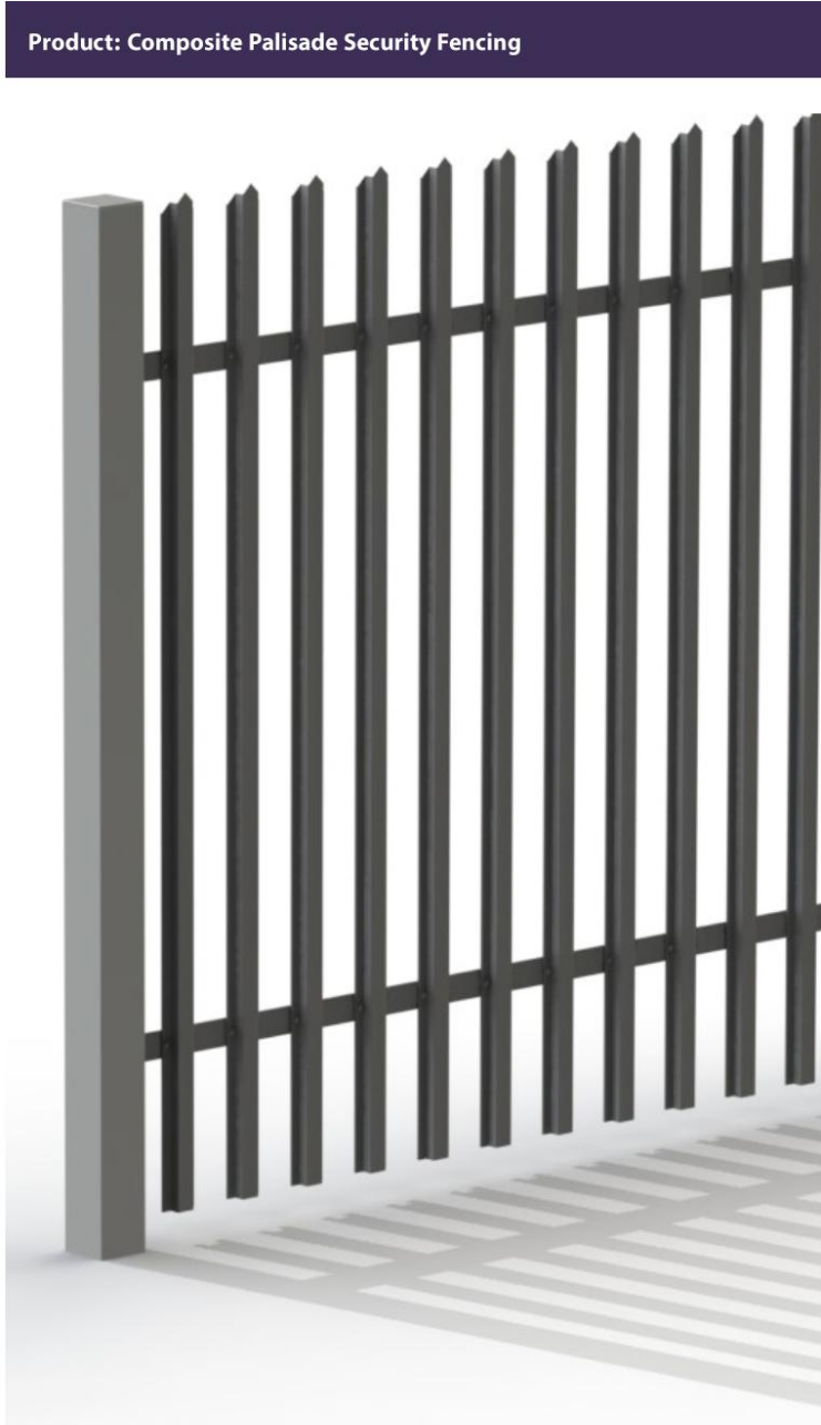
Product: Composite Palisade Security Fencing